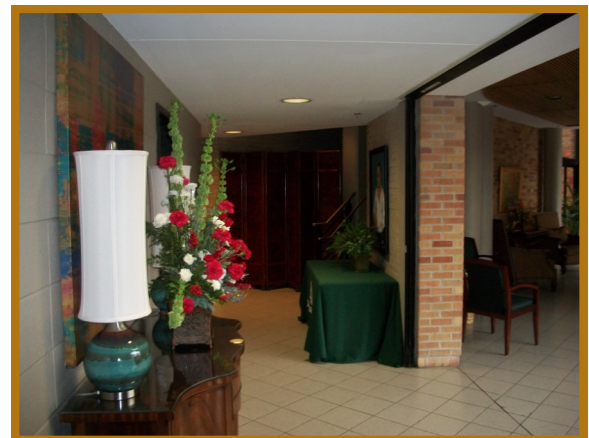
A fresh floral arrangement each week