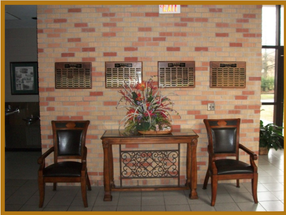
The Veteran's Corner, Veteran's Project